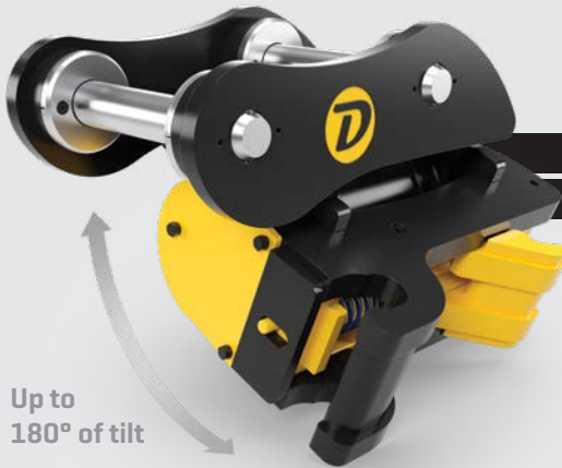
D-LOCK TILT COUPLER