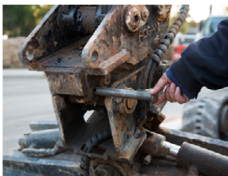
Photo 2: Shows a worker locating the safety pin for the semi-automatic quick hitch. This is an administrative measure, as it depends entirely on the action of the worker.

Further information can also be obtained within the Safe Work Australia Interpretive Guideline – Model Work Health and Safety Act: The meaning of ‘reasonably practicable’ . The model code of practice Managing Risks of Plant in the Workplace , also provides guidance on these concepts, refer section 2.3, Controlling of risks. These documents can be accessed at safeworkaustralia.gov.au