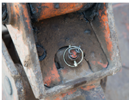
Photo 3: Another type of safety pin, in place and secured by a lynch pin to prevent it coming loose.