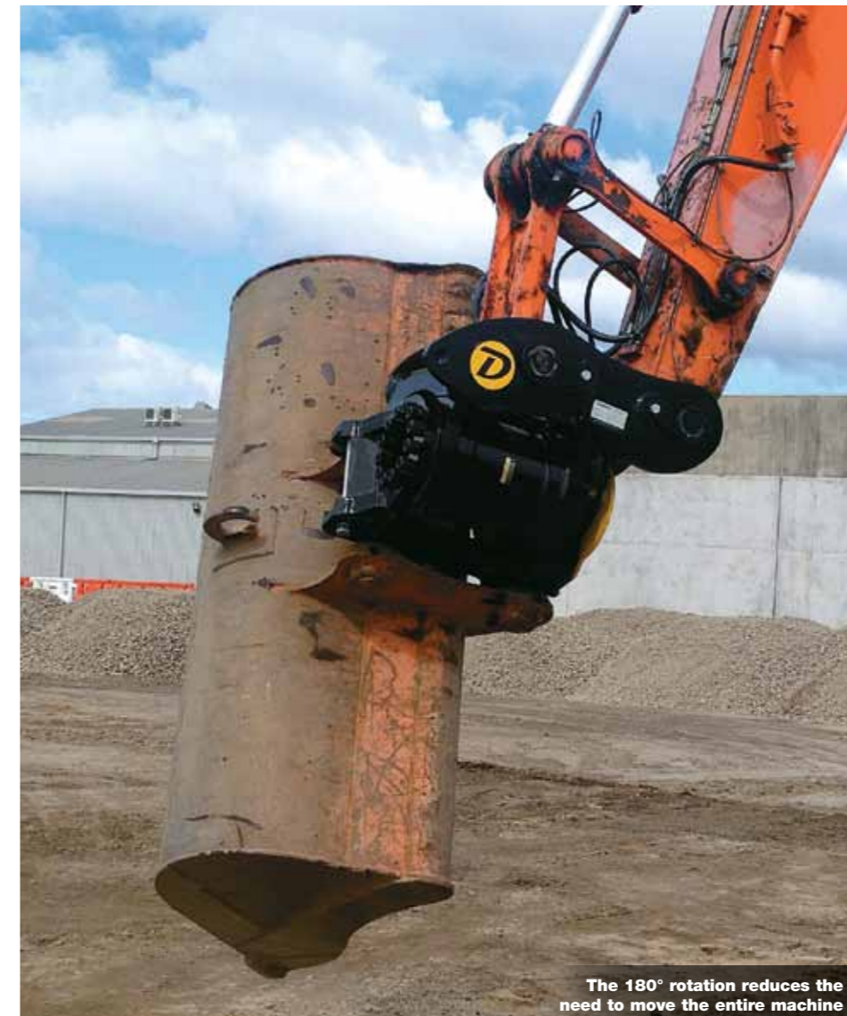
The 180° rotation reduces the need to move the entire machine